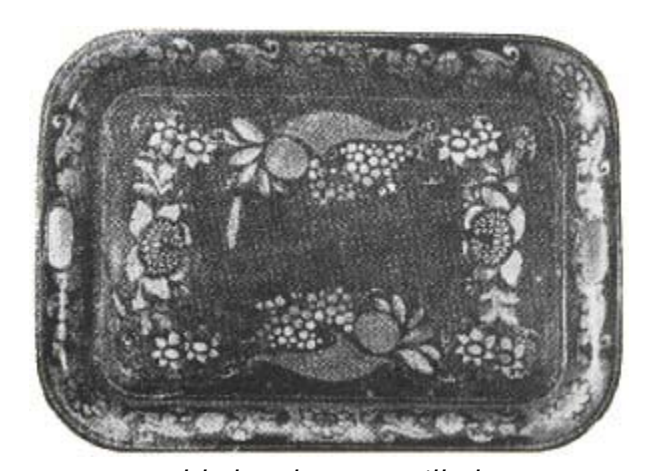
Double borders stencilled on Rectangular tray, about 1830.

Stencilled trays appeared in the United States in 1818 and were popular until 1850. They can be dated by the cutting of the stencils. The modelled leaf was used until 1825. In 1832, veins were cut for the leaves and landscapes appeared. In 1845, stencils were cut in one piece and jagged leaves were much in evidence. In 1850, wet paint was used to speed up the decoration and bronze stencilling went into a decline.