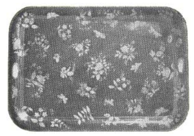
Rectangular tray with gold leaf flower sprays, about 1790.

The Gallery tray was oval with a plain or keyhole pierced standing edge, made about the same time as lace edge trays and the same designs are found on them. However, the floor borders were more elaborate. Sometimes double borders were used, one on the edge, and one on the floor, usually a classical design in gold leaf. Scenes and portraits in a medallion were occasionally depicted as well as flower bouquets.