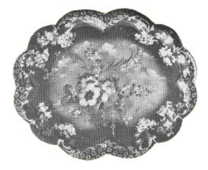
Chippendale flower arrangement on dusted background. Painted flower clusters and gold leaf border -- on scalloped tray.

In 1664, just about twenty years before William and Mary came to England, the first mill for rolling sheet iron was erected in Pontypool, Wales. The invention of tin plating speedily followed. The Dutch journeymen, china painters, and japanners